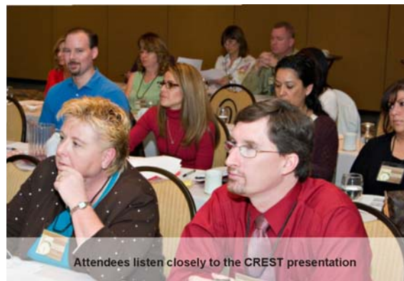
Attendees listen closely to the CREST presentation

Clinical management staff from community health centers across Arizona participated in the Critical Response and Emergency Systems Training (CREST) on Monday February 19, 2007. The session “ Answering the Call in Arizona, Health and Emergency Medical Preparedness and Response ” was presented during the Annual Meeting. The Association’s Clinical Program provides continuous trainings to health center staff to help increase the effectiveness and delivery of quality medical care.